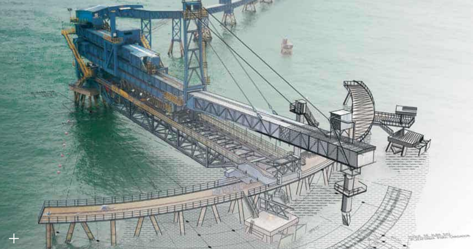
Engineering services, permits, and regulatory support were provided for the Puerto Punta Chungo copper concentrate shipping terminal in Minera Los Pelambres, Chile