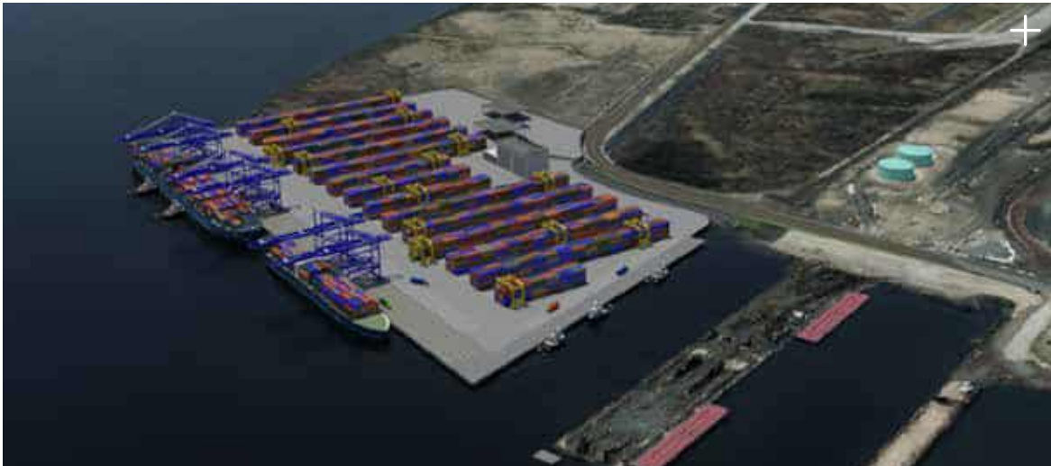
The Philadelphia Regional Port Authority enlisted our help to provide technical advisory services for developing an existing land parcel into the Southport Marine Terminal Complex

We work with you, developing strategic operational-performance programs that can boost your bottom line. We find smarter, more efficient solutions for terminal operations. Then we follow up with support across the full business life cycle, from concept to closure. Across the full value chain, from exploration to market.