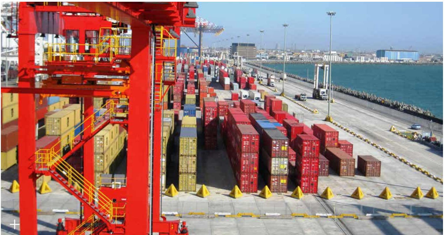
Transnet Expansion Program, Cape Town Container Terminal, Cape Town, South Africa