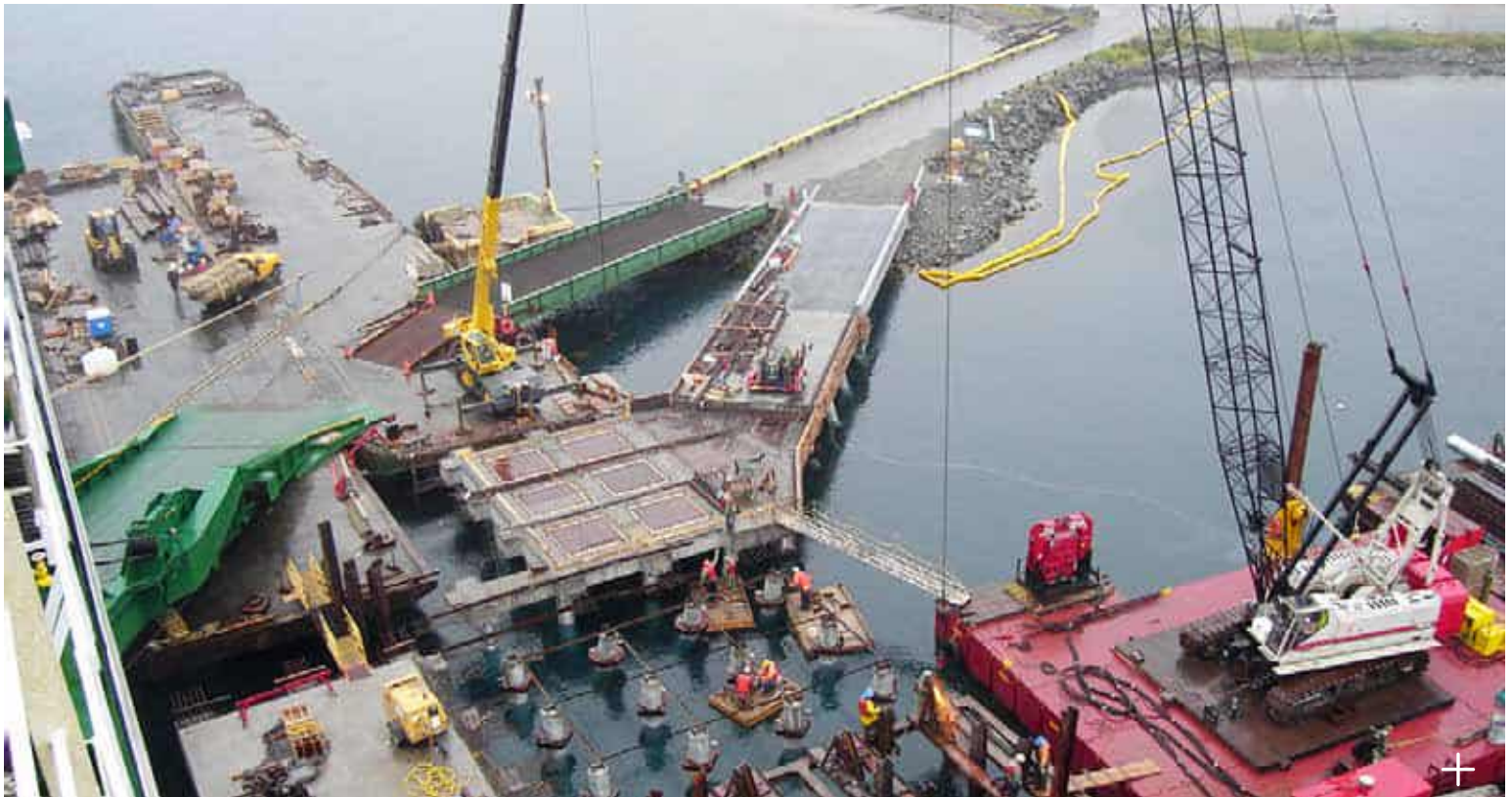
Eastern Passage Auto Dock Wharf Replacement, Canadian National Railway, Canada