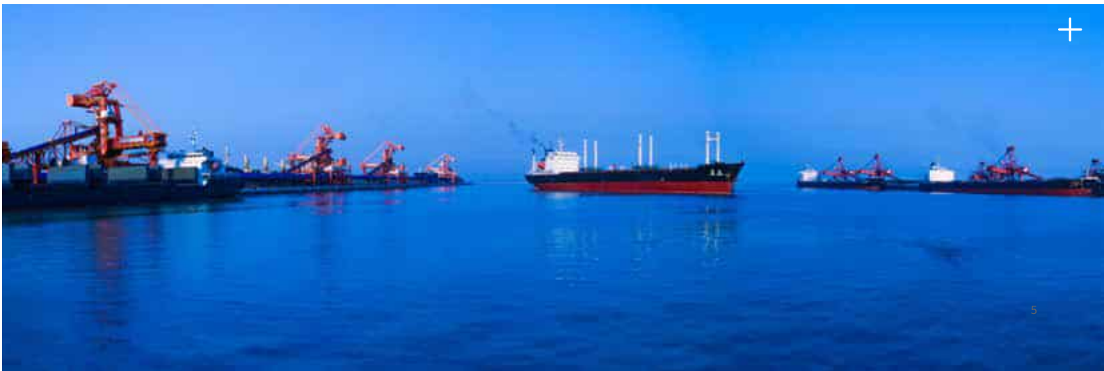
Over 60 projects were identified to enable performance improvements to existing operations as well as expansion plans at Shenhua's Huanghua Port in China